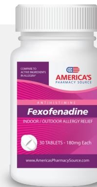
Fexofenadine (Allegra®) 180mg / 30 Count